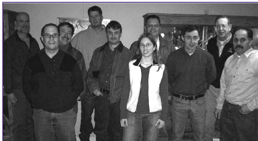
P-4 Council, Chapter 24 Leaders and Members Meeting at the DEP's Sessions Woods Conservation Center in Burlington

» Building Our Strength in the Field: P-4 Council's Chapter 24 leaders are meeting with members working in the State Dept. of Environmental Protection's (DEP) field facilities to address a variety of workplace issues. Council and Chapter officers toured several Western District worksites in late-January to hear from forestry, fisheries, parks, and wildlife professionals on a wide range of concerns, from repairing aging field facilities, to closing gaps between job classes, to improving outreach and communications for newer members. Though many of our members working out of the field offices in Litchfield, Thomaston, Harwinton, and Pleasant Valley provide specialized environmental, conservation, and recreational public services, they face many of the same challenges impacting all of our Council members.