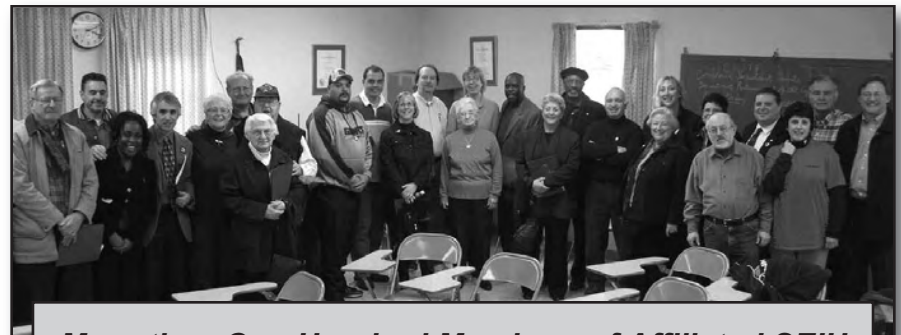
More than One Hundred Members of Affiliated SEIU Locals in Connecticut Met at Our Hall in January to Discuss the Presidential Elections

Let's face it. Either one of these candidates will be better on issues affecting workers and their families than the current administration we have had to endure for nearly eight years. When the primary selection process finally sorts itself out, I am quite confident that our labor movement will be united.