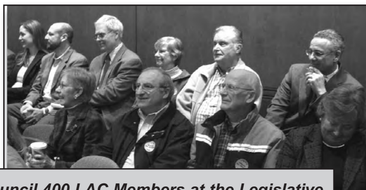
Council 400 LAC Members at the Legislative Briefing on Long-Term Care Issues