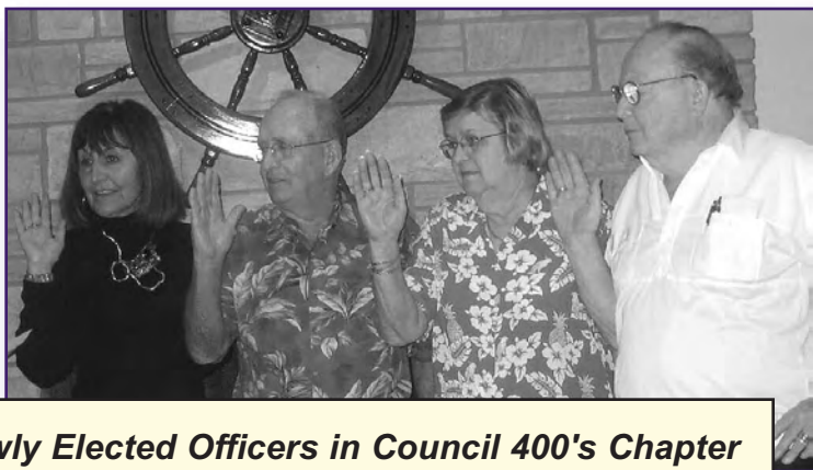
Newly Elected Officers in Council 400's Chapter 427 Take the Oath of Office at the Vero Beach Yacht Club

» 2008 is a Time for New Leadership: And not just in the White House -- all Council 400 Executive and Chapter officers are up for re-election this year, too! Our Nominating Committee, which is made up of seventeen current members, met on February 21 to begin the process of reviewing candidates for leadership positions at the Council level. Contact your Chapter's delegate to the Committee to sign-up or nominate a fellow member to serve today!