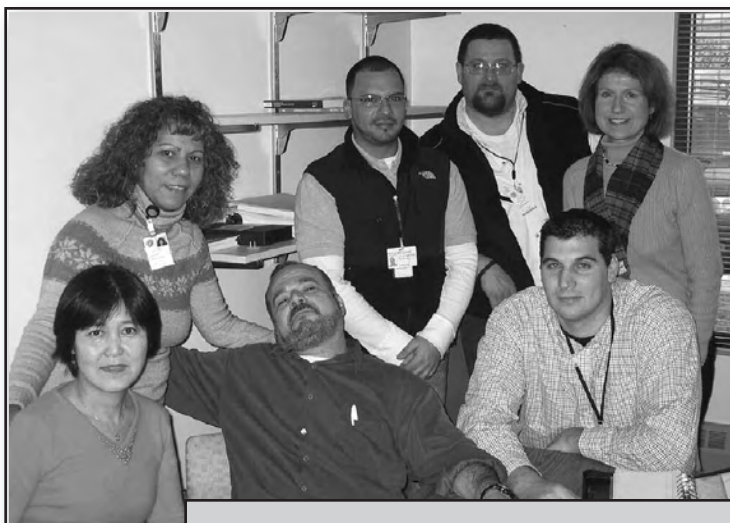
Council 760 Chapter 848 Public Health Sanitarians Working for the City of Hartford

review the benefits of the reclassification. This long-awaited outcome is a "triple-win;" residents and the City win a more professional, highly