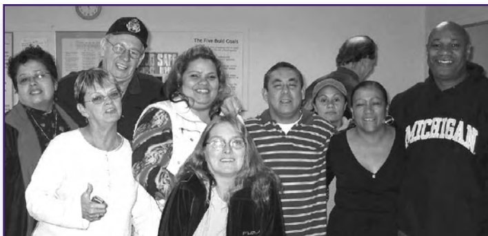
New Haven Bus Drivers Celebrate After Voting to Ratify Our New Contract

After seven months of mobilizing for strength at our worksites, and reaching out for solidarity from the community, our members working as school bus drivers in New Haven have a strong new 5-year contract. On October 13, the agreement with First Student, Inc., the multi-national transportation corporation contracted to the local district, was ratified in a membership vote that ended a tense and difficult struggle we have reported on in the last five editions of the CSEA News. Our Bargaining Team secured an agreement that raises economic standards for our members, including pay raises that average $1.00 per hour for each year of the contract, expanded health care coverage for drivers, and increased compensation of premiums by the employer. Let's all congratulate our Chapter 1106 members, who overcame enormous workplace challenges to win this new contract!