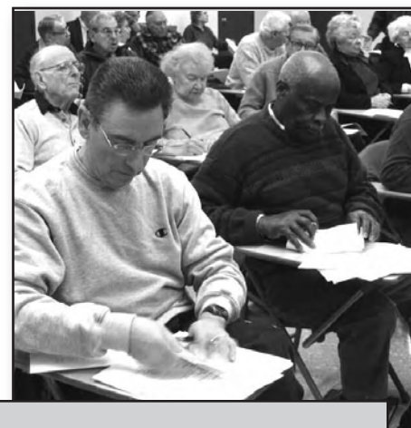
Council 400 Members Writing Letters on Medicare Reform

»» Paying Higher Medicare Premiums? Are you a retired state worker who is Medicare eligible and paying MORE than the individual basic $96.40 or couple basic $192.80 monthly Part B premium effective January 1, 2008? Send in the letter you receive from Medicare/Social Security indicating a HIGHER premium only to the State Retirement Division, Payroll Dept., 55 Elm St., Hartford, CT 06106. Are you nearing Medicare age? You will receive a Medicare card prior to your 65th birthday, which you need to copy, along with the accompanying letter and send to the Retirement Division, too. Once eligible, Medicare becomes your "primary" insurer and your State health plan carrier becomes your 'wrap around' insurer. Remember, you do not need to sign up for Medicare Prescription Drug Coverage unless told otherwise!