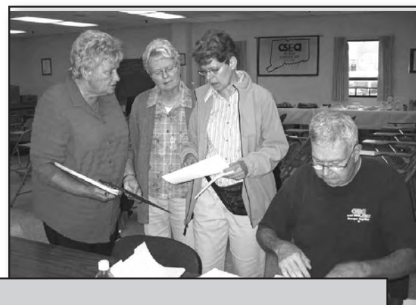
Council 400 Membership Committee Members Prepare Organizing Packets