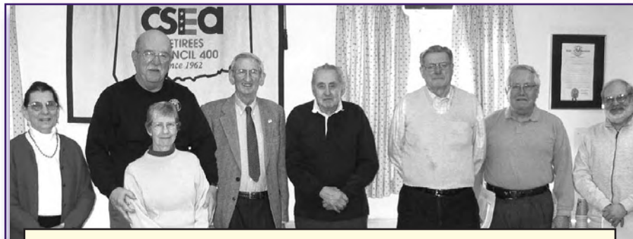
Council 400 Legislative Action Committee Members Reviewing Proposed Health Care Reforms at our Union Hall

Members of our Legislative Action Committee (LAC) met monthly over the summer and fall to propose, discuss, and debate the priority state issues for CSEA/SEIU Local 2001 in 2008. Our LAC members voted on a quality public services agenda to devote our collective time, energy, and resources to in the next session of the General Assembly.