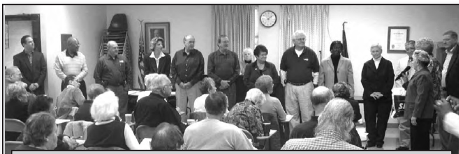
Members of the State Employees Association of North Carolina (SEANC) Receive Council 400 Red Berets at Our Delegates Meeting in November