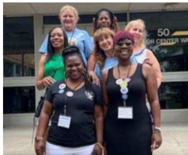
ABOVE: P3B Members pose in front of the Labor Center at Rutgers University.