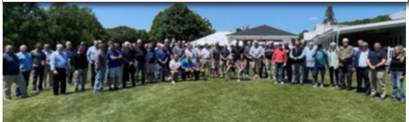
ABOVE: Inspectors Council Members enjoy the Annual Inspectors Council Picnic