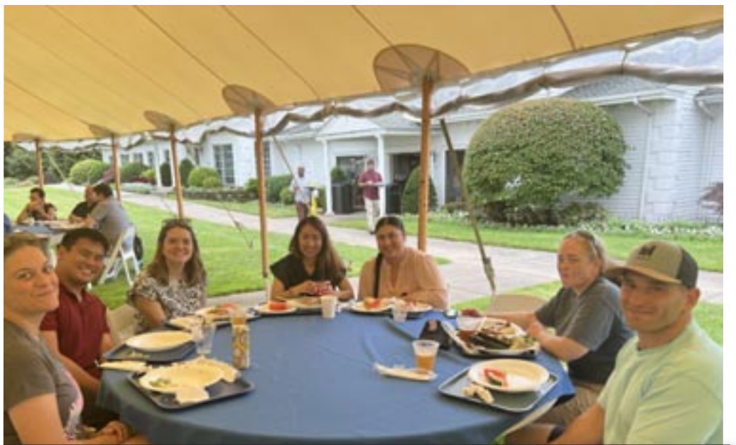
ABOVE: P4 members gather around to enjoy lunch with one another.