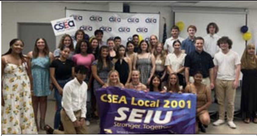
ABOVE: 62 students were awarded the Bernard McCusker Memorial Scholarship at the CSEA Union Hall this year.