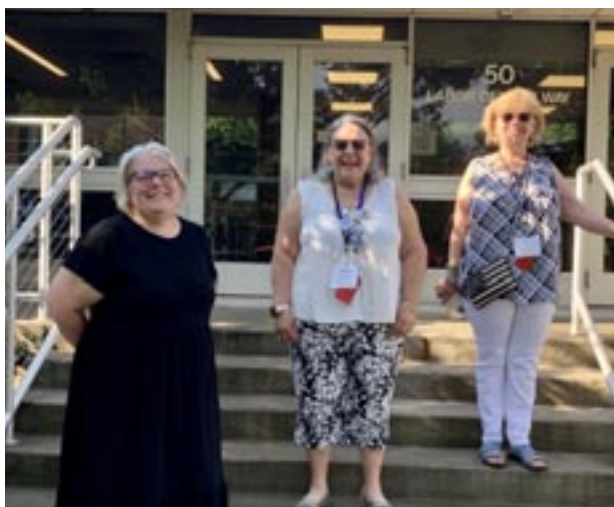
ABOVE: Para Council Members pose in front of the Labor Center at Rutgers University.

Women from all over the US came together to build on their leadership skills and participated in a wide array of workshops from climate's impact on labor organizing to women in labor history night and heard from panelists from all over the world.