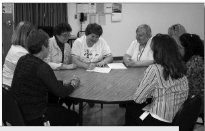
Thompson Public Schools Non-Certified Employees in Our Paraprofessional Council Met in May to Discuss District Budget Issues

SEIU's rank-and-file members throughout the country and CSEA members here in Connecticut worked with Congress to pass legislation over the summer to provide billions of dollars to protect public service jobs. As a result of this recent legislation, Connecticut has already received over $300 million in federal funds since President Barack Obama signed the Education Jobs and Medicaid Assistance Act (H.R. 1586) into law in August. Resources have been allocated to retain, recall, or rehire former public employees and to hire new workers to offer early childhood, elementary, or secondary educational services. It also allocates Federal Matching Assistance Program (FMAP) money to support states' Medicaid services.