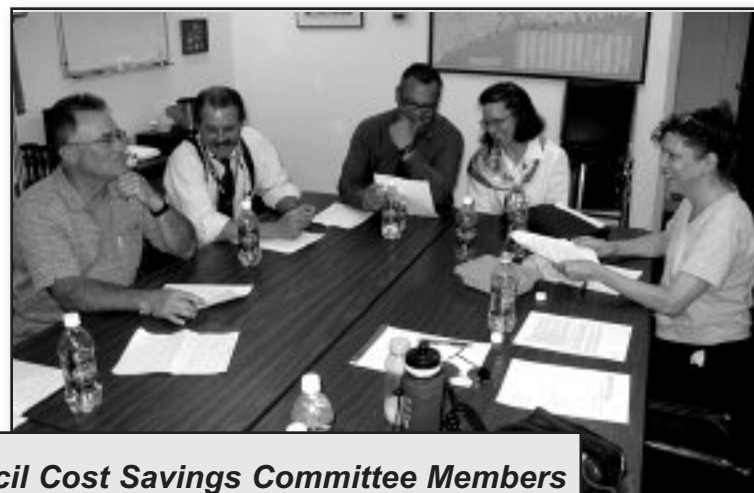
P-4 Council Cost Savings Committee Members Review Proposals for Reducing Expenses

Governor Rell followed up her press release with an Op-Ed