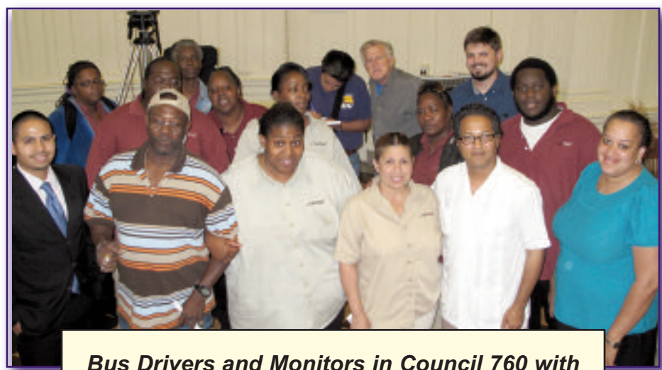
Bus Drivers and Monitors in Council 760 with Hartford City Council and School Board Members at City Hall

▶▶ Hartford School Bus Workers are Holding Contractors Accountable: Council 760 members who are school bus drivers and monitors in the Hartford Public School system have worked since 1999 to pass and then strengthen a livable wage law. The Hartford Court of Common Council approved the Living Wage Ordinance due to our members' hard work and because of the need to provide good paying and stable jobs in the city. When school bus transportation providers started gaming the system to avoid paying a fair wage by utilizing a deceptive subcontracting scheme, our members sounded the alarm. At our urging, the Common Council passed a tough and comprehensive resolution that authorizes a sweeping investigation that will expose these contractors' tactics to Hartford's parents, taxpayers, and school bus employees.