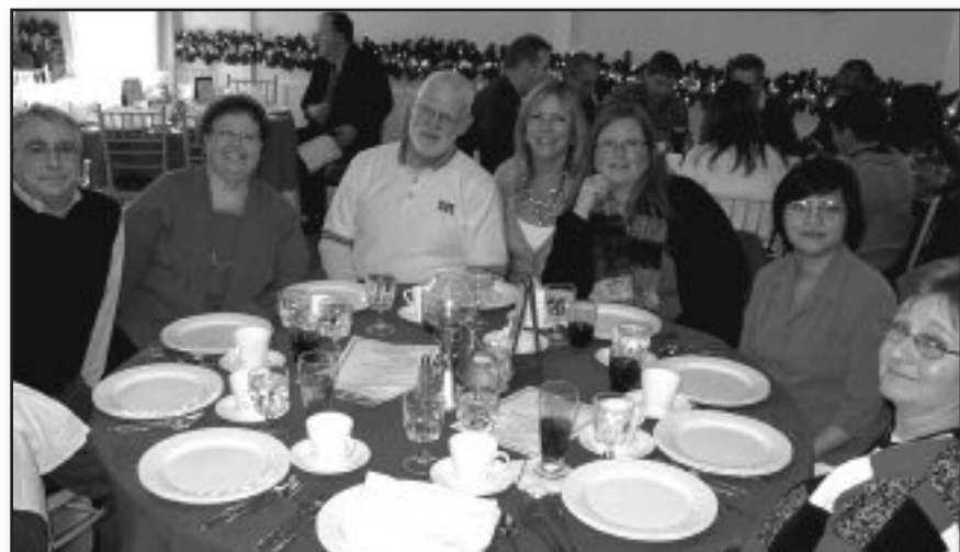
IT Professionals who Protect Data at the State Dept. of Administrative Services at the P-4 Council's 2010 Holiday Party

Stay connected between editions of the CSEA News and learn about many issues not covered because of its limited space by visiting our website. Access news and updates and find out about upcoming Union events and activities.