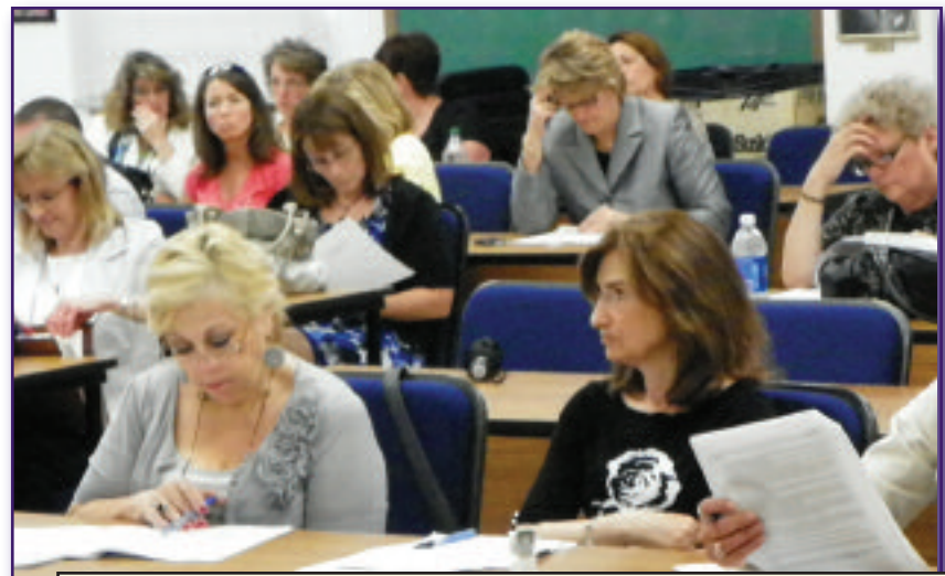
P-3A Council State Education Administrators Heard a Presentation on the HEP at Our Union Hall in June

Participating members will pay lower monthly premiums and have no deductible for in-network care for the plan. Those with specified chronic conditions will also receive a $100 cash payment and reduced co-pays on certain prescriptions if they comply with the program.