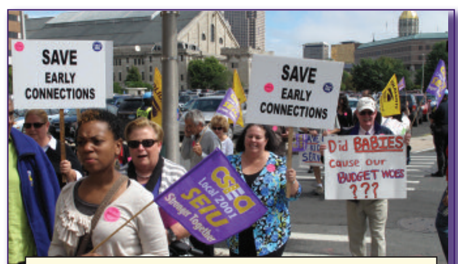
Parents, Advocates, and Union Members Marched and Rallied Along Capitol Avenue for the Families they Serve

Teachers and therapists in CSEA and District 1199/SEIU are continuing to stand up for children and families who depend on quality Birth to Three services. They began mobilizing strong and vocal opposition to plans by the Department of Developmental Services (DDS) to shut-down Early Connections in July. The vital program, which meets the developmental and health-related needs of infants and toddlers with delays or disabilities, was slated for closure under Governor Dannel P. Malloy's alternative state budget.