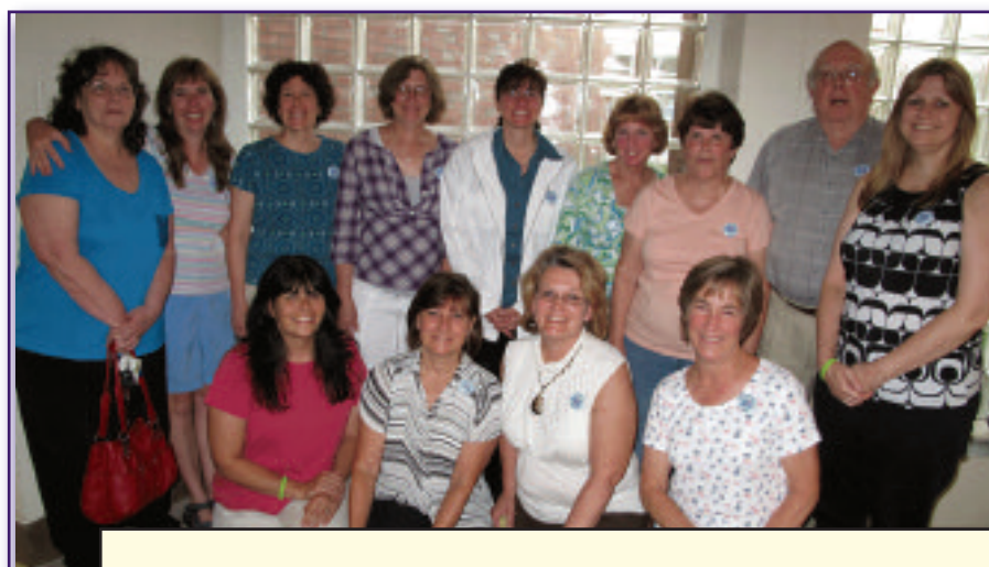
Hebron Schools Paraprofessional and Council 760 Members After Moving their Board of Education to Rescind Painful Layoffs in June 2010