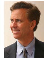
Ned Lamont (D)