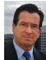
Dan Malloy (D)