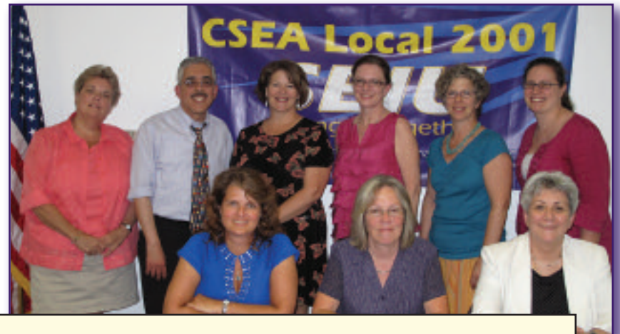
P-3A Council Members Elected in July 2010 to Provide Guidance and Direction for the Next Two Years

▶▶ Selecting Our Leaders for the Road Ahead: Since May of this year, Union members have been holding elections to select from among their peers those who will serve in leadership positions over the next two years. Results, which include Council officers, Executive Council delegates and alternates, auditors, and McCusker Scholarship Fund trustees, are being posted to our Union website at each individual Council's main page. Council elections are being conducted in advance of the CSEA 2010 Convention on Friday, September 24 , with registration beginning at 8:30 AM at Central Connecticut State University's Student Center in New Britain . Council 760 is holding its elections for its Council officers, Executive Council delegates and alternates, McCusker Scholarship trustee and auditors prior to commencement of the Convention that same morning at 8:00 AM . Delegates elected at the Chapter level will cast votes at the Convention for our two Union officers, President and Secretary-Treasurer, from among the elected delegates to the CSEA Executive Council. As we announced in the June CSEA News, the other purpose of the Convention is to act on properly submitted proposed constitutional amendments.