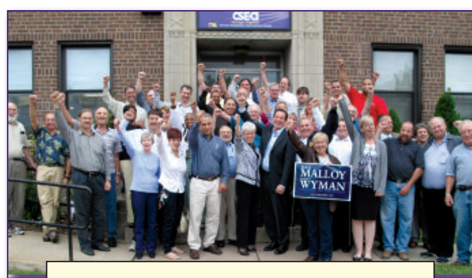
Dan Malloy and Nancy Wyman Joined Our Members at the Union Hall to Celebrate their Primary Election Win

Union members greeted the end of Connecticut's primary season with a significant victory on August 10 after weeks of intensive "Get Out The Vote" efforts on behalf of our endorsed candidates for statewide office. Thousands of mailers and member-to-member phone calls ensured that we played an important role in Dan Malloy's come-from-behind win in the all-important race to secure the Democratic Party's nomination for governor in the November 2 General Election.