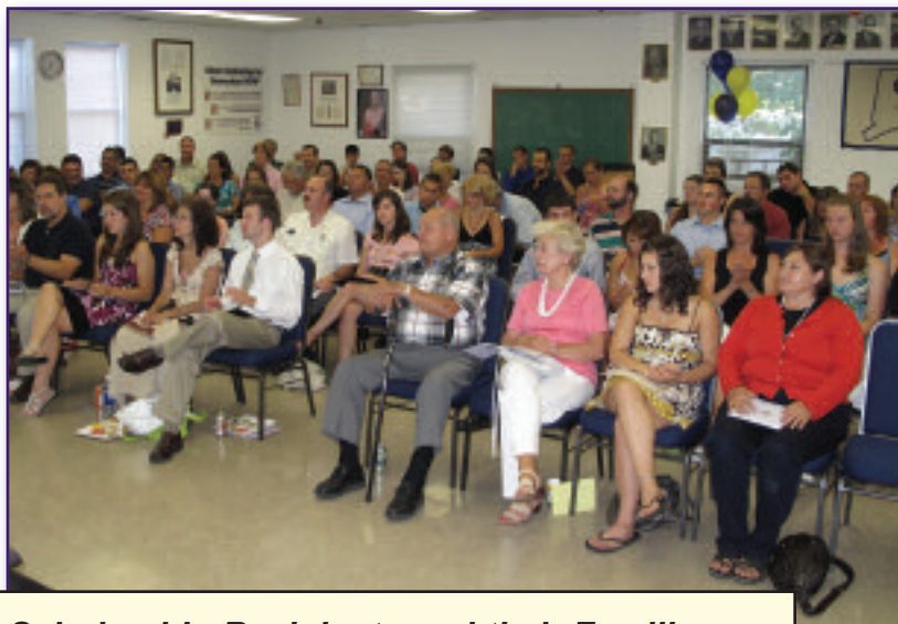
Scholarship Recipients and their Families Gathered at Our Union Hall for McCusker Awards Night 2010 in July

(Editor's note: A downloadable version of the order form is available at our website's "McCusker Scholarships" page which can be accessed from the main "Incentives" page.)