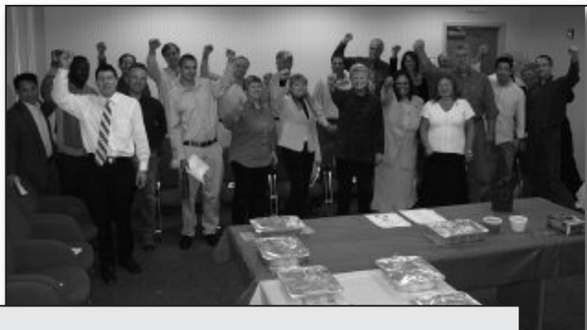
P-4 Council Members Working at the State Department of Public Utility Control at a Chapter Meeting in October